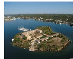
Festivals Adventure Nature Relax Trekking Sun Beaches